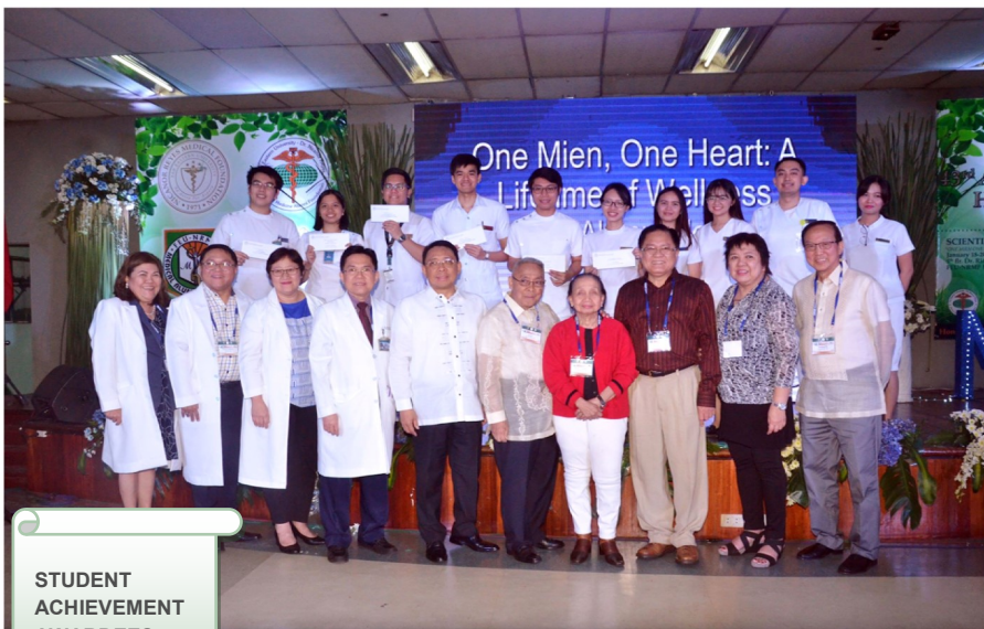
STUDENT ACHIEVEMENT AWARDEES