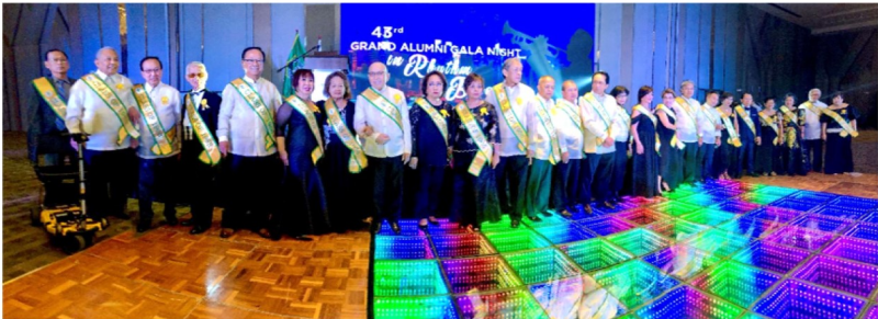
Presentation of the Golden Jubilarians during Grand Alumni Night