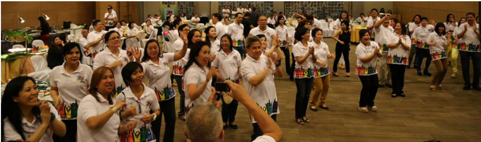
Class 88 wearing their Class shirts at the Alumni Night at Unilab