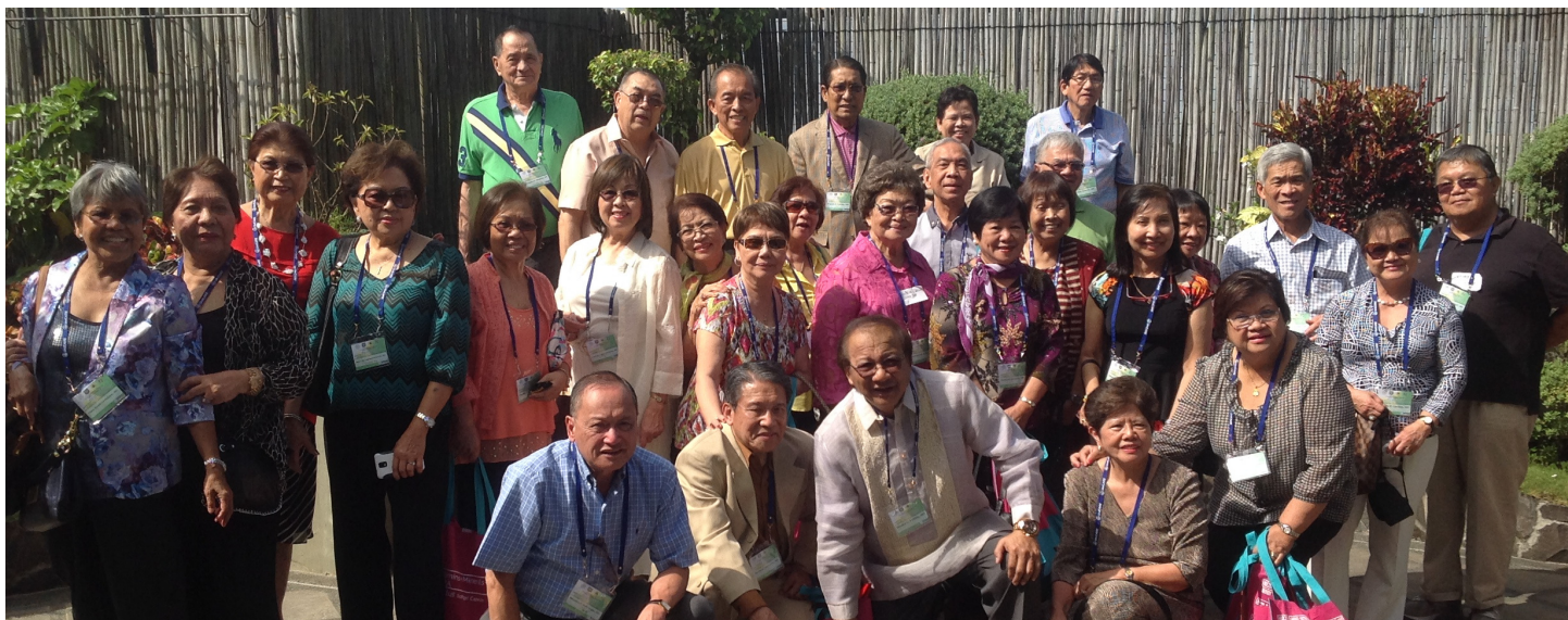
Class 64 in a picnic group picture.