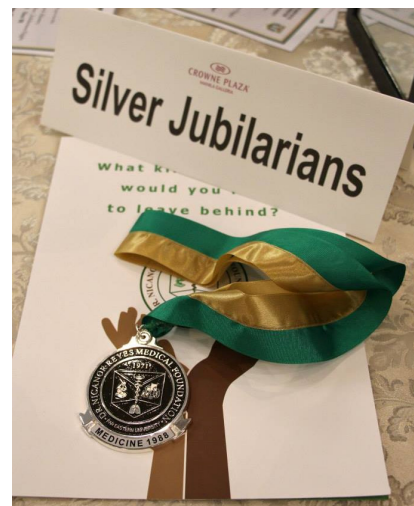
The treasured Silver Medallion