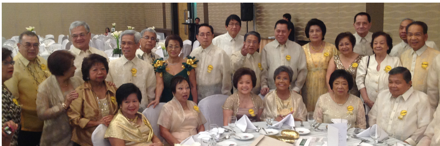
The Golden Jubilarians during Saturday grand reunion night at the Crown Plaza Manila Galleria.