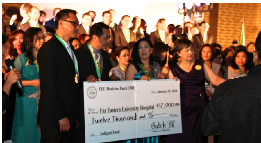
Class 88 donates $12000 to the Indigent Patient Fund.