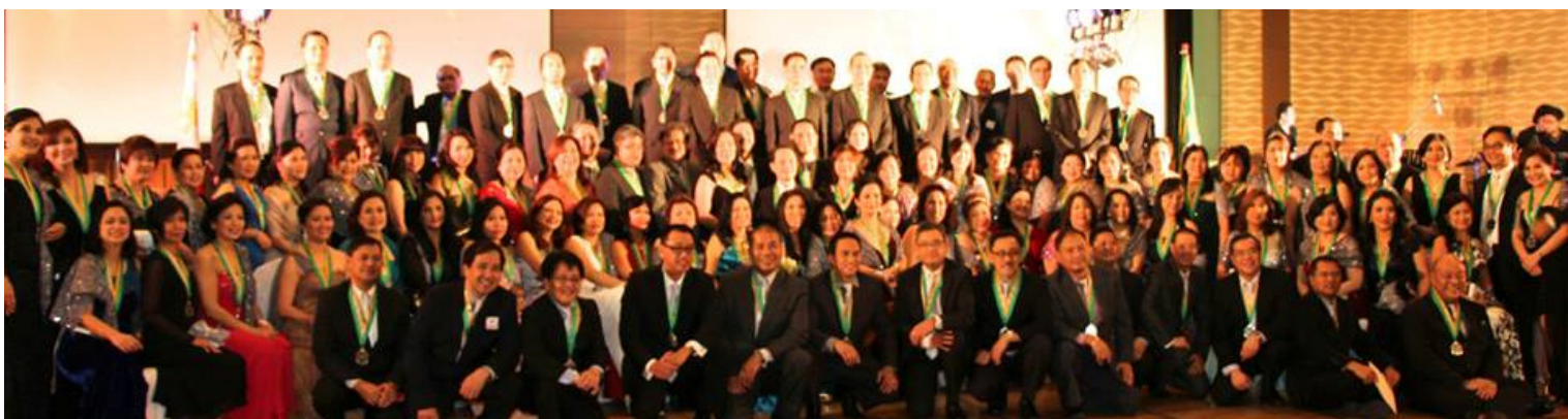
The Class 88 Silver Jubilarians with their medallions on the Grand Alumni Night