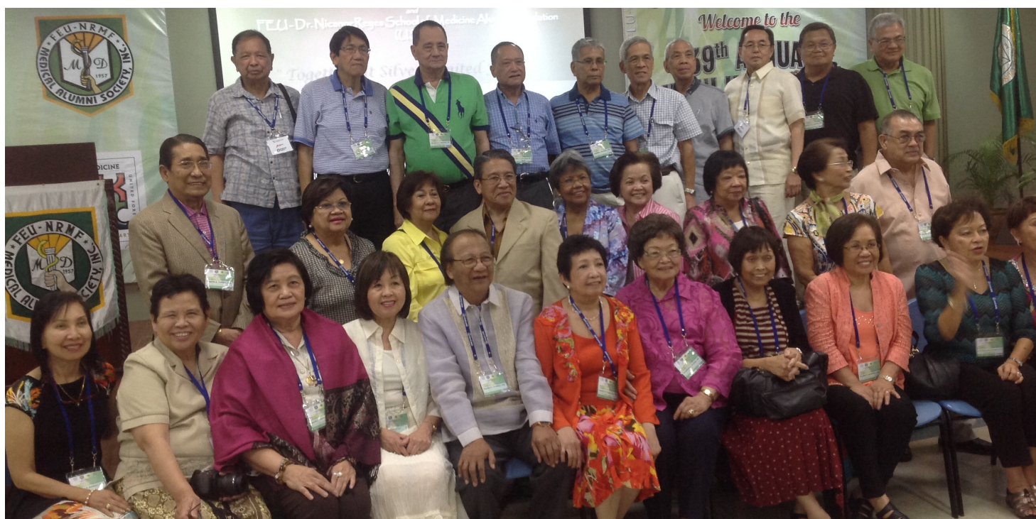
Class 64 at Balik-FEU scientific convention at the Dr Ricardo Alfonso Conference Hall.