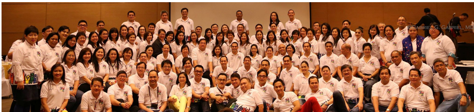
Class 88 enjoying each other's company at the Alumni Night