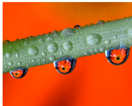
Gerbera Flower Reflection on Water Droplets